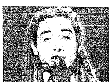
Jason Castro's Most Memorable Idol Songs